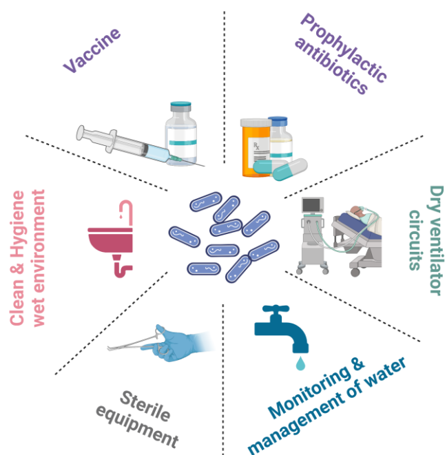
Figure 3. Preventive measures against infections of Achromobacter xylosoxidans

Measures to improve hygiene in wet environments have also been proposed as a preventive strategy [36]. This includes regular cleaning and disinfection of surfaces and equipment in areas where A. xylosoxidans is commonly found. Disinfection of surgical equipment has been proposed as a strategy to prevent A. xylosoxidans infection [35]. This involves the use of disinfectants to eliminate bacteria on surgical instruments, reducing the risk of infection during medical procedures. Overall, these preventive measures offer promising avenues for reducing the incidence and impact of A. xylosoxidans infection. Measure strategies that could be used to prevent the transmission and infection of A. xylosoxidans have been presented in Figure 3 .